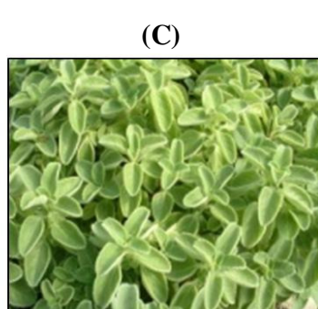
Fig. 1: Medicinal plants in their natural habitat. J. communis (A), U. dioica (B) and C. forskohlii(C). Materials and Methods